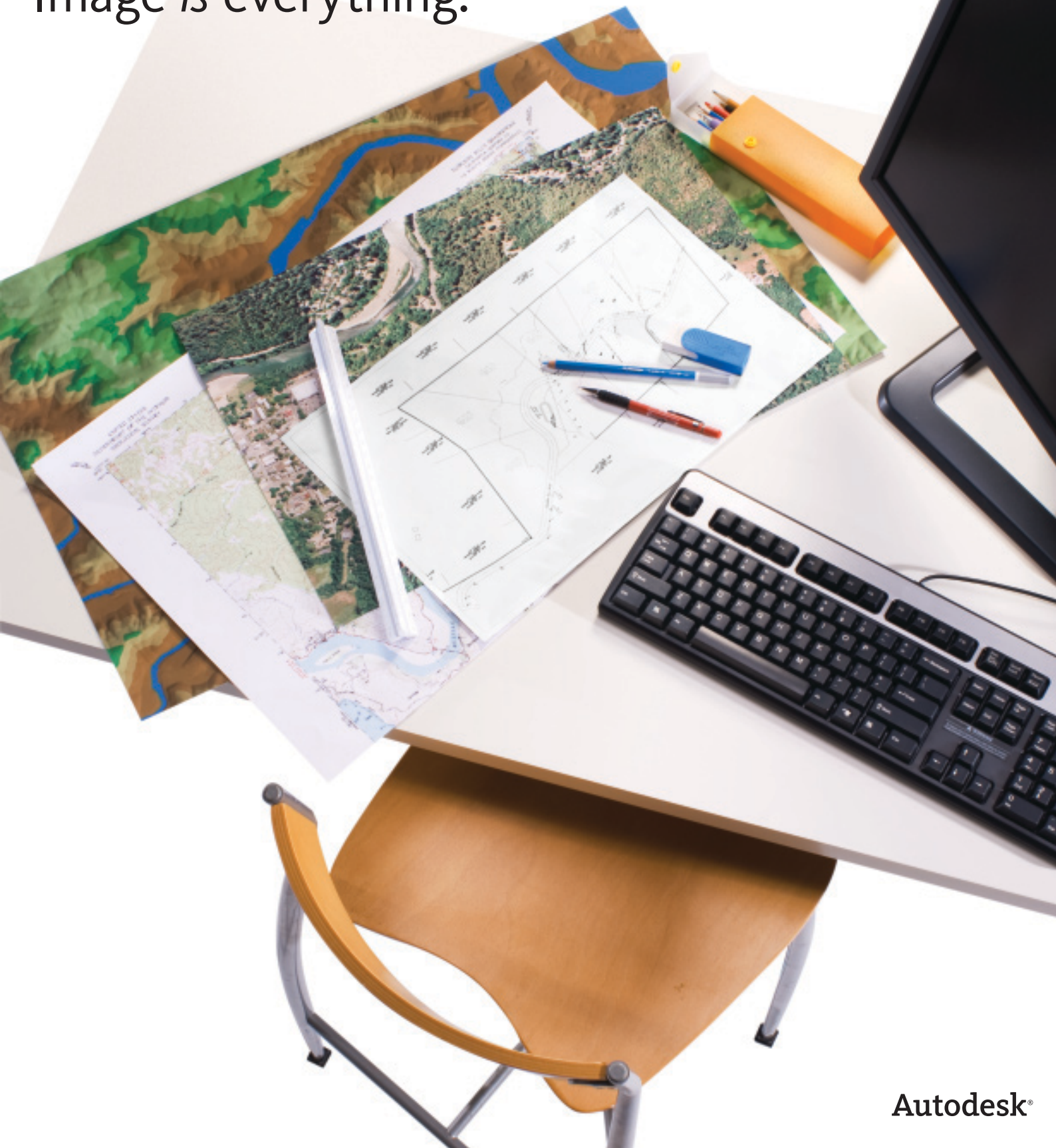
Image is everything.